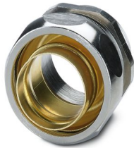
Cable gland made from brass with Pg thread, IP65 protection

Please be informed that the data shown in this PDF document is generated from our online catalog. Please find the complete data in the user documentation. Our general terms of use for downloads are valid.