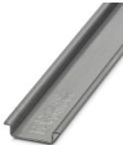
DIN rail, unperforated, Width: 35 mm, Height: 7.5 mm, Length: 2000 mm, Color: silver

Please be informed that the data shown in this PDF Document is generated from our Online Catalog. Please find the complete data in the user's documentation. Our General Terms of Use for Downloads are valid ( http://phoenixcontact.com/download )