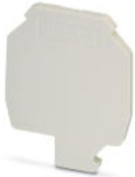
End cover, insulation material: ceramic

Please be informed that the data shown in this PDF Document is generated from our Online Catalog. Please find the complete data in the user's documentation. Our General Terms of Use for Downloads are valid ( http://phoenixcontact.com/download )