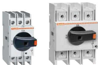
GA016 A... GA040 A GA063 SA