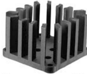
Representative Photo Only