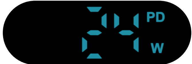
With digital power display

DP Alt-Mode DisplayPort Alt-Mode Supports: 8K @ 60Hz