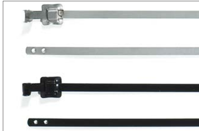
MLT-Series. Releasable Stainless Steel buckle tie with and without coating.