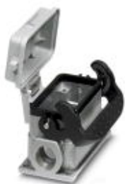
HEAVYCON box mounting base B10, with double locking latch, height 52 mm, with supports 2xM25 and protective cover

Please be informed that the data shown in this PDF Document is generated from our Online Catalog. Please find the complete data in the user's documentation. Our General Terms of Use for Downloads are valid ( http://phoenixcontact.com/download )