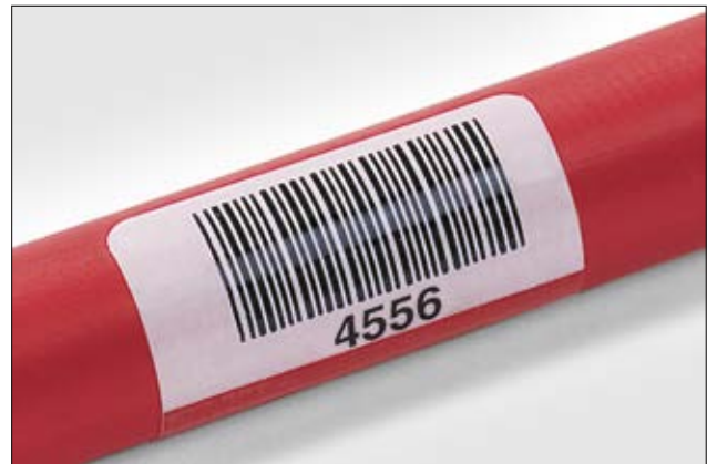
Laminating the mark gives long-term print survivability.