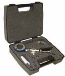
Pneumatic test kit