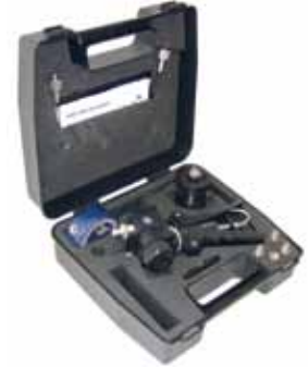
Pneumatic and hydraulic test kit