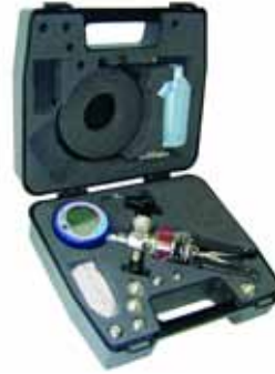
Hydraulic test kit

Includes: DPI 104; ranges to 15,000 psi (1000 bar), PV 212 hydraulic test pump, hose, adaptors, seal kit and case.