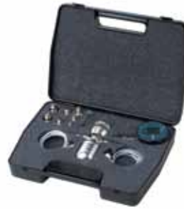
Low pressure pneumatic test kit

Includes: DPI 104; ranges to 30 psi (2 bar), PV 210 low pressure pneumatic test pump, hose, adaptors, seal kit and case.