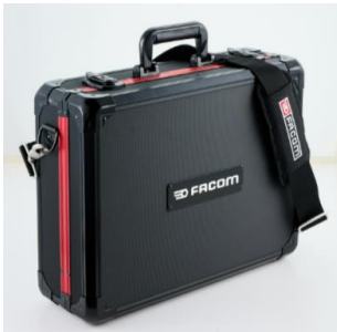
Empty case : BV.BAS