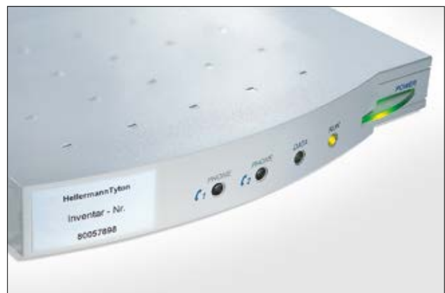
Helatag labels for permanent asset identification.