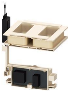
Magnet coil with switch-on electronics for contactor 3TF6844-.C..., 380...460 V AC 50/60 Hz