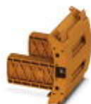
Dummy plug, color: orange