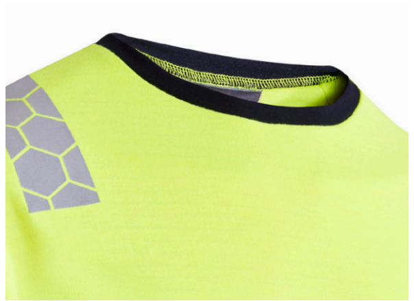
Round contrast colour neck rib knit