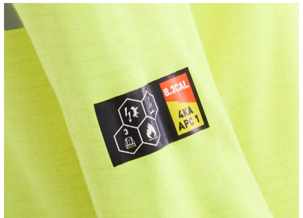
SafetyICON™ with clear ARC rating