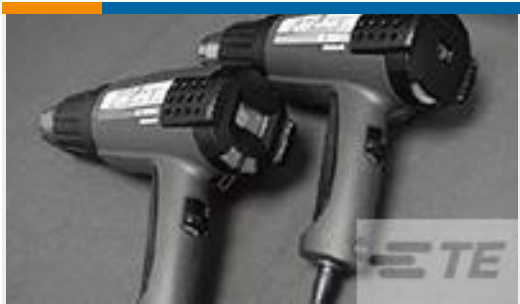
TE Part # CJ2087-000 HL2010E-KIT-120V

This information is provided based on reasonable inquiry of our suppliers and represents our current actual knowledge based on the information they provided. This information is subject to change. The part numbers that TE has identified as EU RoHS compliant have a maximum concentration of 0.1% by weight in homogenous materials for lead, hexavalent chromium, mercury, PBB, PBDE, DBP, BBP, DEHP, DIBP, and 0.01% for cadmium, or qualify for an exemption to these limits as defined in the Annexes of Directive 2011/65/EU (RoHS2). Finished electrical and electronic equipment products will be CE marked as required by Directive 2011/65/EU. Components may not be CE marked. Additionally, the part numbers that TE has identified as EU ELV compliant have a maximum concentration of 0.1% by weight in homogenous materials for lead, hexavalent chromium, and mercury, and 0.01% for cadmium, or qualify for an exemption to these limits as defined in the Annexes of Directive 2000/53/EC (ELV). Regarding the REACH Regulation, the information TE provides on SVHC in articles for this part number is based on the latest European Chemicals Agency (ECHA) 'Guidance on requirements for substances in articles' posted at this URL: https://echa.europa.eu/guidance-documents/guidance-on-reach