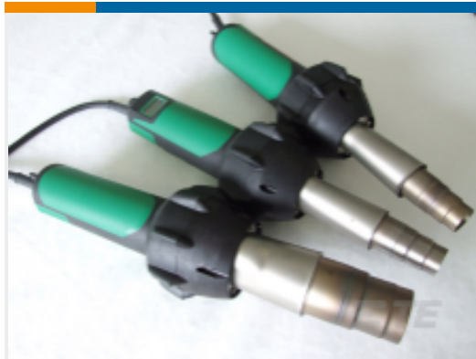
TE Part # EG1114-000 CV1981-ST-230V1600W-EU