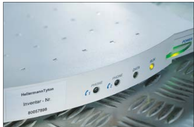
Helatag label for a permanent asset identification.