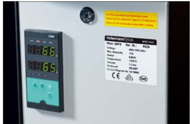
Professional type plate on a heating unit.