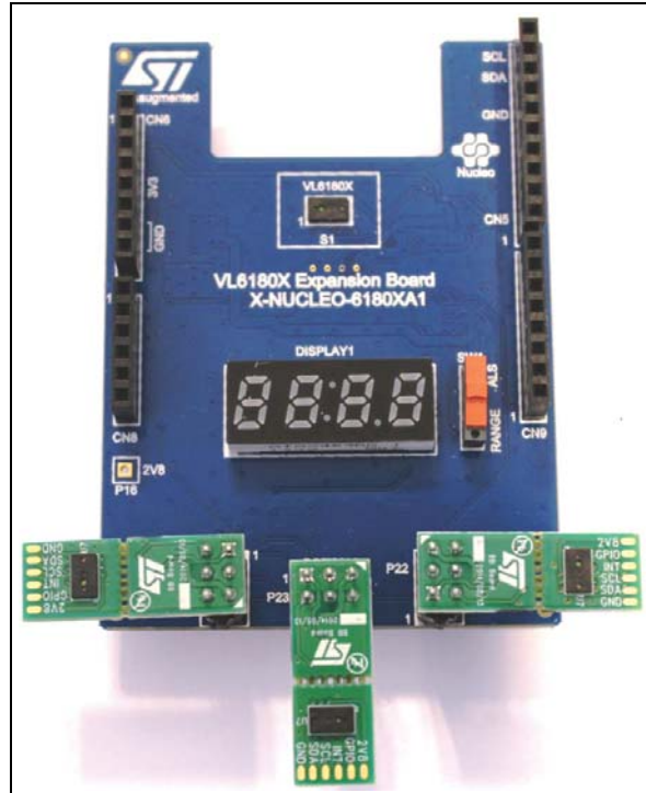
Figure 2. Connections of VL6180X satellite boards

Note: VL6180X satellite boards can be ordered under the reference: VL6180X-SATEL.