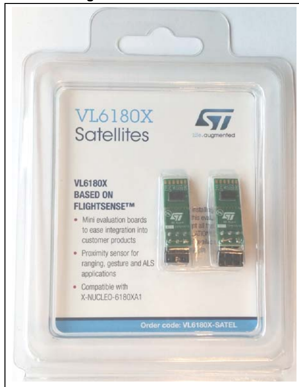
Figure 3. VL6180X-SATEL

Note: VL6180X satellite boards can be ordered under the reference: VL6180X-SATEL.