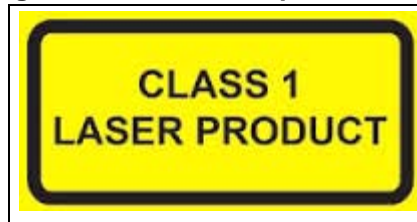
Figure 4. Class 1 laser product label

The VL6180X contains a laser emitter and corresponding drive circuitry. The laser output is designed to remain within Class 1 laser safety limits under all reasonably foreseeable conditions including single faults in compliance with IEC 60825-1:2007. The laser output will remain within Class 1 limits as long as the STMicroelectronics recommended device settings are used and the operating conditions specified in the datasheet are respected. The laser output power must not be increased by any means and no optics should be used with the intention of focusing the laser beam.