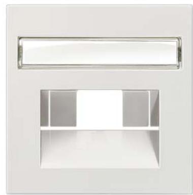
DELTA profil, titanium white Cover plate UAE connection socket suitable for Rutenbeck Cat. 3+5/ BTR Cat. 6, 65x 65 mm with labeling field