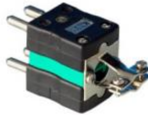
Standard Duplex clamp when fitted