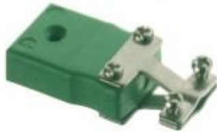
Miniature clamp when fitted