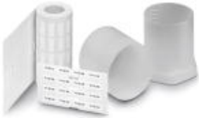
The figure shows the EML (20X8)R product variant

Label, Roll, transparent, unlabeled, can be labeled with: THERMOMARK ROLL, THERMOMARK ROLL X1, THERMOMARK X, THERMOMARK S1.1, Mounting type: Adhesive, Lettering field: 37 x 90000 mm