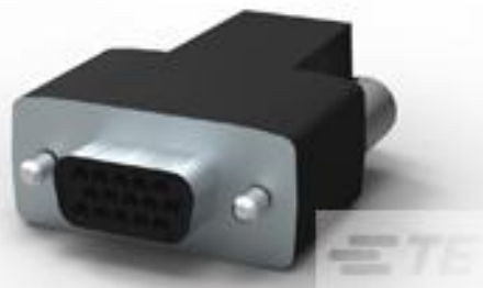
TE Part #1658688-1 KIT, HDP-22, ENCLSUR, RCPT, SIZE 1