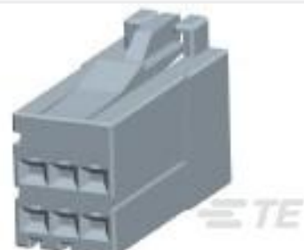
TE Part #1-1717834-3 DYNAMIC 2000 REC HSG 6P X KEY WITH CUTTI