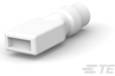
TE Part #170892-4 187 FASTON HSG., REC., NATURAL