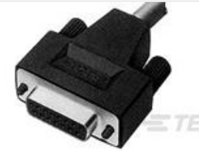
TE Part #1658658-1 KIT, HDP-20, ENCLSUR, RCPT, SIZE 3