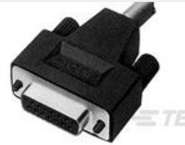
TE Part #1658656-1 KIT, HDP-20, ENCLSUR, RCPT, SIZE 2