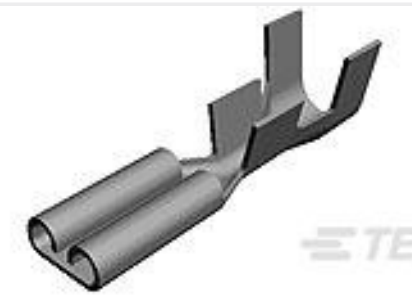
TE Part #170203-2 187 FASTON, REC., 24-20 AWG, TPBR