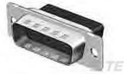
TE Part #1658642-1 HDP-20, PLUG, SIZE 1, 9 POSN, CLI