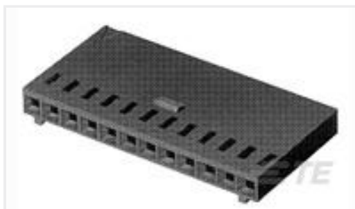
TE Part #102241-8 10 MODIV HSG COMP SR .100 POL