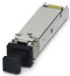
The small form-factor plug-in module provides a fiber optic interface with a data transmission speed of 100 Mbps with a wavelength of 1310 nm (long).