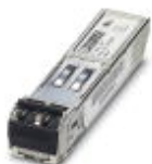
Gigabit SFP module for transmission up to 2 km with a wavelength of 1310 nm.