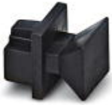
Dust protection caps for RJ45 socket

Dust protection - FL RJ45 PROTECT CAP - 2832991