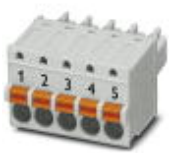
PCB connector, nominal current: 8 A, rated voltage (III/2): 160 V, nominal cross section: 1.5 mm 2 , number of positions: 5, pitch: 3.81 mm, connection method: Push-in spring connection, color: light gray, contact surface: Tin

Printed-circuit board connector - FK-MCP 1,5/ 5-ST-3,81GY35BD1-5 - 1015782