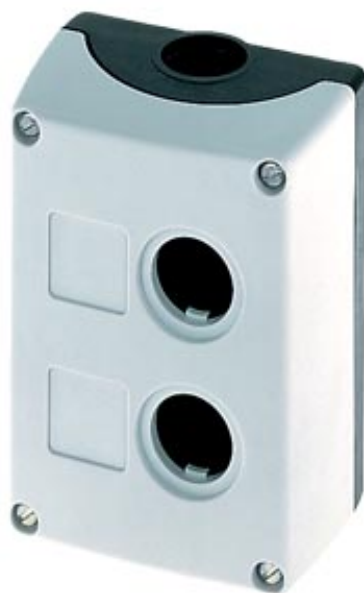
ENCLOSURE FOR 22MM PROGRAM METAL VERSION 2 COMMAND POSITIONS GRAY TOP PART