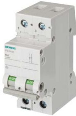
off switch 32A 2-pole