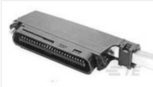
TE Part #5229912-1 KIT, PLUG, 50 POS,B SLOT C/LOK