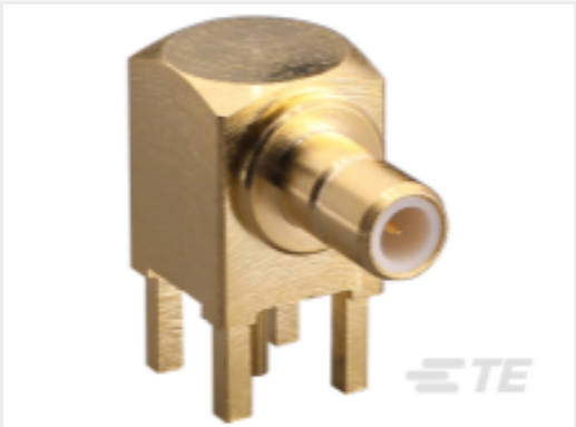
TE Part #CONSMB002-G SMB Jack 50 Ohm PCB Through Hole