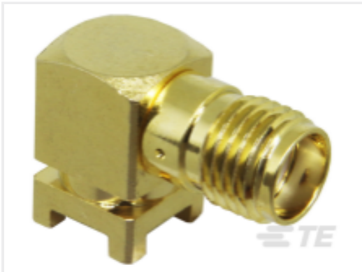
TE Part #CONSMA002-SMD-G-T SMA Jack 50 Ohm PCB Surface Mount