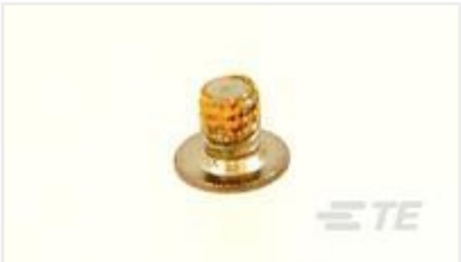
TE Part #1410946-2 MULTI-GIG SOC. CAP SCREW, CUSTOMIZED HDW