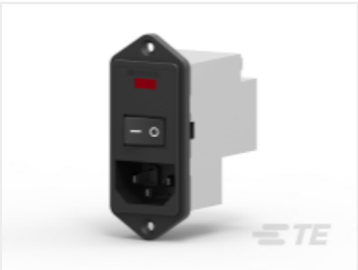
TE Part #6-6609959-6 PM0S0DBX0=C5280