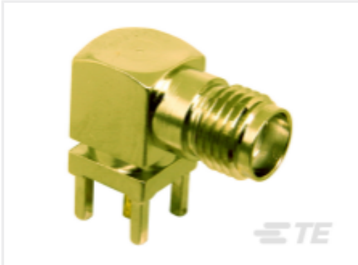
TE Part #CONSMA002-G SMA Jack 50 Ohm PCB Through Hole