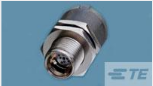
TE Part #1925261-1 QCM008M5P = Circular