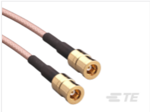
TE Part #CSE-SMBM-152-SMBM SMB to SMB 152mm RG316