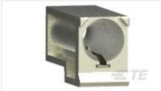
TE Part #1-1469492-1 MULTIGIG RT 9MM GUIDE/ESD 0 DEG