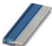
Plug-in bridge, length: 50 mm, color: blue

Plug-in bridge - FBST 50-PLC BU - 1081051