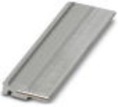
Plug-in bridge, length: 50 mm, color: gray

Plug-in bridge - FBST 50-PLC GY - 1081053