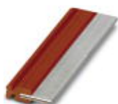
Plug-in bridge, length: 50 mm, color: red

Plug-in bridge - FBST 50-PLC RD - 1081050