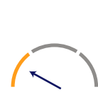
ISO 20471 CLASS 1