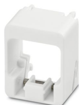
Plug Guard Security Frame

Please be informed that the data shown in this PDF document is generated from our online catalog. Please find the complete data in the user documentation. Our general terms of use for downloads are valid.