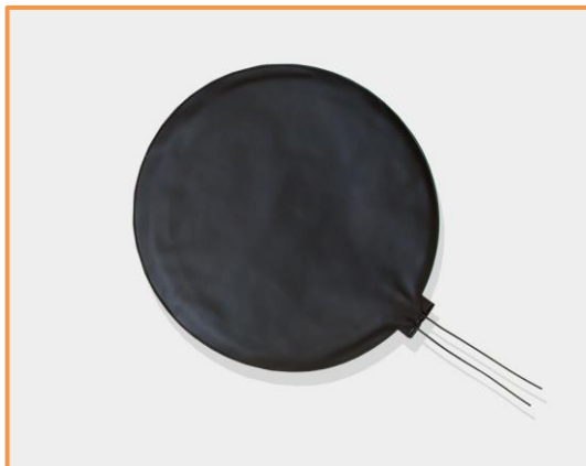
RS 788-4978 Disc Pressure Pad