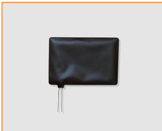
RS 788-4971 Small Pressure Pad