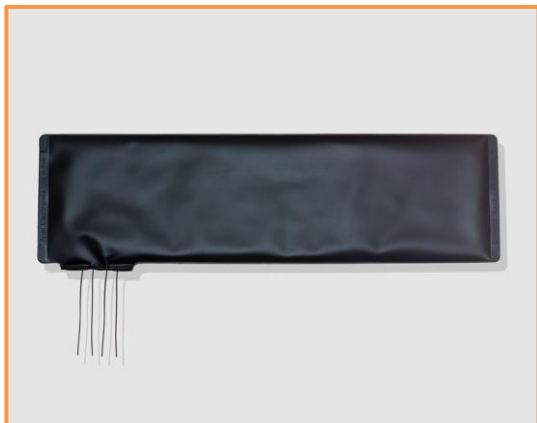
RS 317-140 Stair Tread Pressure Mat