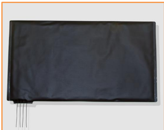
RS 317-156 Standard Floor Pressure Mat