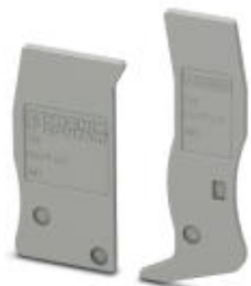
Cover segments, large segment: 29 x 12.1 x 2, small segment: 22.65 x 12.9 x 2, color: gray

Please be informed that the data shown in this PDF Document is generated from our Online Catalog. Please find the complete data in the user's documentation. Our General Terms of Use for Downloads are valid ( http://phoenixcontact.com/download )