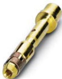
Crimp contact, turned, Single contact, contact diameter: 1 mm, crimp range: 0.34 mm 2 ... 0.5 mm 2

Please be informed that the data shown in this PDF Document is generated from our Online Catalog. Please find the complete data in the user's documentation. Our General Terms of Use for Downloads are valid ( http://phoenixcontact.com/download )