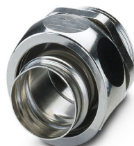
Cable gland made from brass with Pg thread, IP40 protection

Please be informed that the data shown in this PDF document is generated from our online catalog. Please find the complete data in the user documentation. Our general terms of use for downloads are valid.