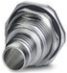
M8 pin, rear mounting

Housing screw connection - SACC-BP-M-M8/M12 SMD - 1412505