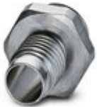
M8 pin, front mounting SMD with M10 screw fastening

Housing screw connection - SACC-FP-M-M8/M10 SMD - 1412502