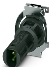
SPE PCB connector, type: IEC 63171-5, degree of protection: IP65/IP67, number of positions: 2, CAT B (ISO/IEC 63171), connection method: SMD, Single Pair Ethernet

Please be informed that the data shown in this PDF Document is generated from our Online Catalog. Please find the complete data in the user's documentation. Our General Terms of Use for Downloads are valid ( http://phoenixcontact.com/download )