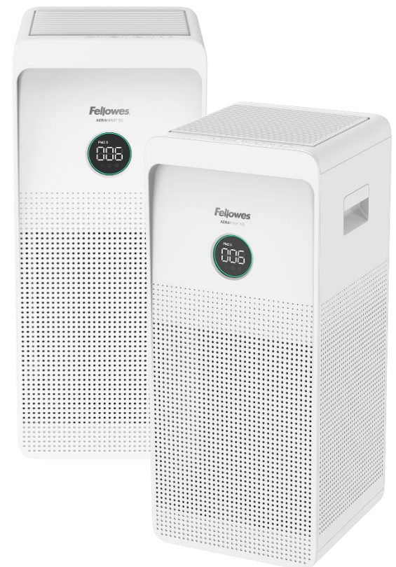
Item # 9799401 Dimensions: 745 x 320 x 320mm