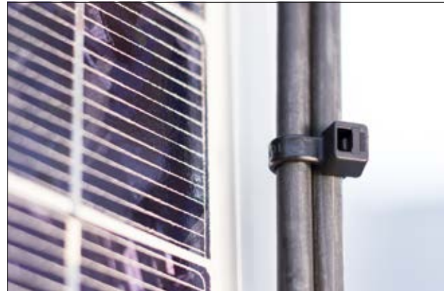
A sustainable T-Series cable tie with high resistance to chemicals and UV light.