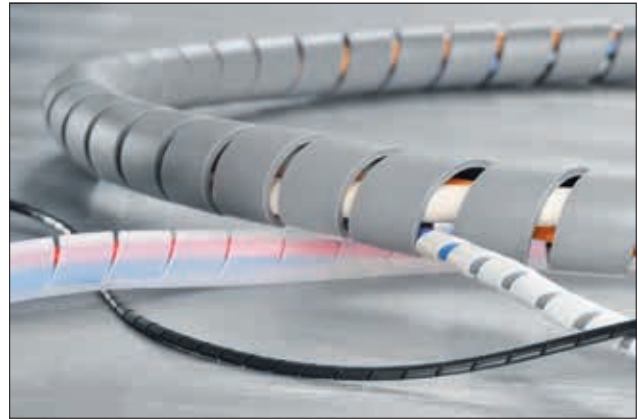
Spiral binding SBPE.