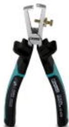
Stripping pliers, for stripping conductors with a cross section of up to 10 mm 2 , VDE-tested

Please be informed that the data shown in this PDF Document is generated from our Online Catalog. Please find the complete data in the user's documentation. Our General Terms of Use for Downloads are valid ( http://phoenixcontact.com/download )