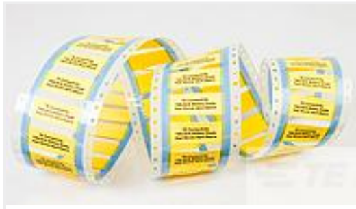
TE Part #0937690001 TMS-SCE-3/8-2.0-S1-9