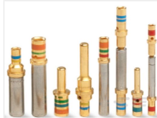
TE Part #ZPF000000000000363 006-0937-20