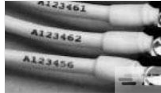
TE Part #5053292059 RNF-100-1-0-STK