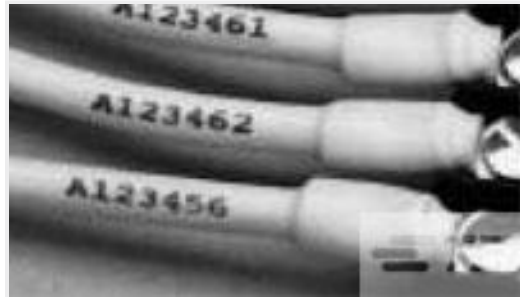
TE Part #5053144070 RNF-100-3/8-0-SP