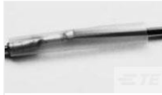
TE Part #CV25372001 RW-175-E-3/16-X-STK