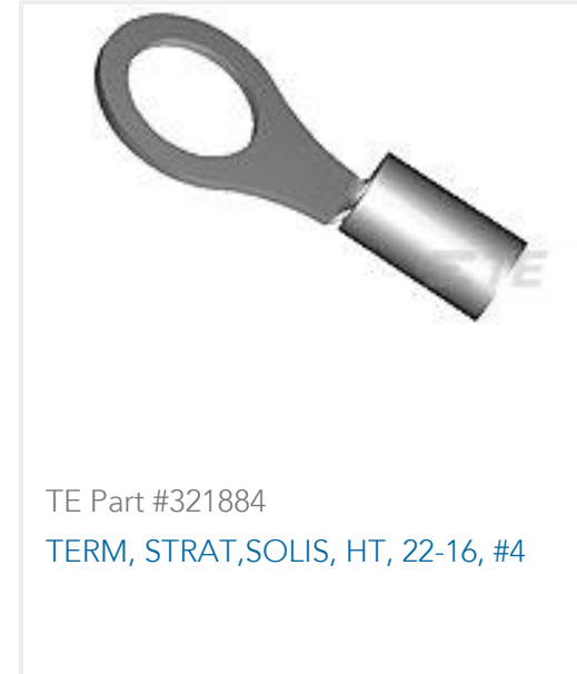
TE Part #321884 TERM, STRAT,SOLIS, HT, 22-16, #4