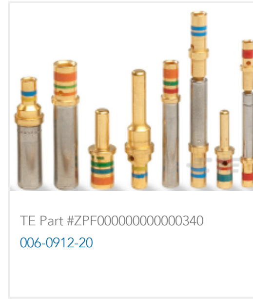
TE Part #ZPF000000000000340 006-0912-20