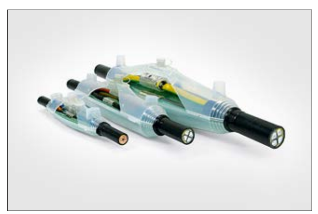
Straight-through joints i-Line SF (safe-filling) / Straight through joints i-A Line SF (safe-filling) – Armoured.