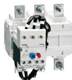
RF420 Motor protection relay