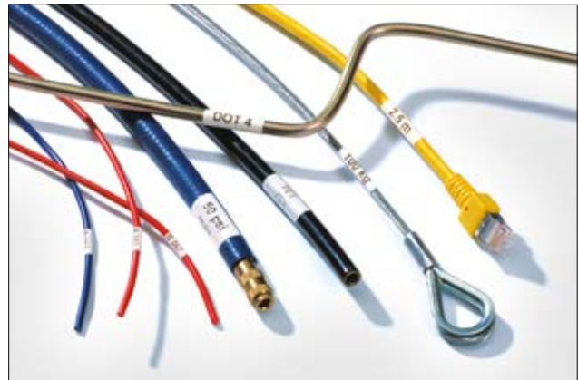
Easy marking of flexible, semi-rigid and rigid cables and wires.