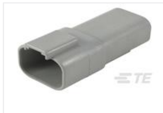
TE Part #DT04-4P REC, 4P, GRY, N