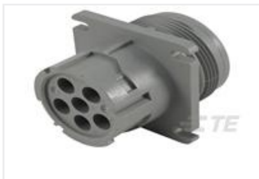
TE Part #HD10-6-12P REC, 6P, GRY, N, THRD, FLANGE, 12