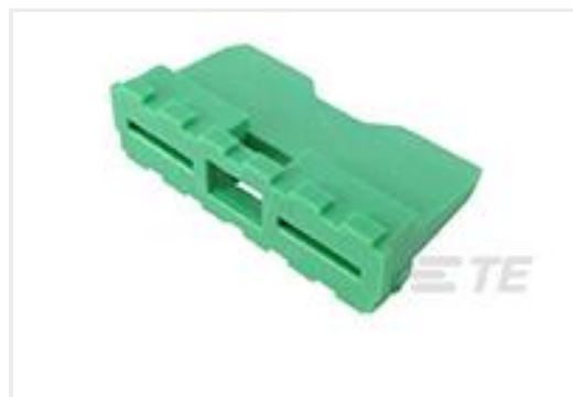
TE Part #W12P WEDGE LOCK, 12P, REC, GRN, DT