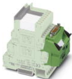
V8-OUTPUT adapter for eight 6.2 mm PLC interfaces (1 PDT, etc./see "Additional Products"). 15-pin D-SUB male connector, control logic: Positive switching

Please be informed that the data shown in this PDF Document is generated from our Online Catalog. Please find the complete data in the user's documentation. Our General Terms of Use for Downloads are valid ( http://phoenixcontact.com/download )