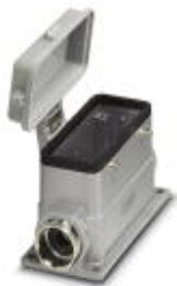
Box mounting base, for double locking latch, height 67 mm, with screw connection, 2x Pg21

Please be informed that the data shown in this PDF Document is generated from our Online Catalog. Please find the complete data in the user's documentation. Our General Terms of Use for Downloads are valid ( http://phoenixcontact.com/download )