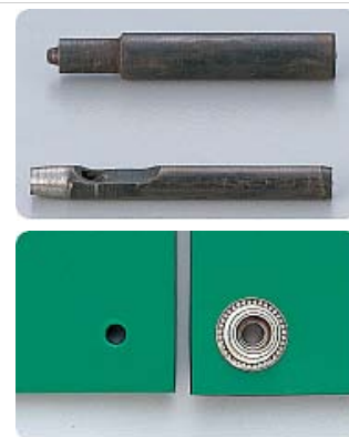
Example of pre-cut hole & clinching stud