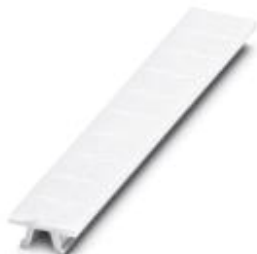
The illustration shows the version ZB 6:UNBEDRUCKT

Zack marker strip, 10-section, horizontally labeled with the identical number: 2, white, Width: 6 mm