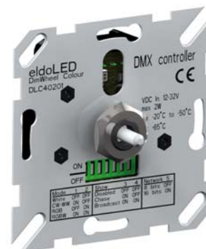
DimWheel Colour (EU/UK)

DimWheel Colour offers two types of show modes: broadcast and chase. You can use broadcast mode for mood lighting where all connected luminaires receive the same set point (=colour) and use chase mode for linear dynamic applications. You can define and upload show sequences to the DimWheel Colour yourself by connecting the eldoLED TOOLbox to the DimWheel's LedSync-in interface and using the freely available TOOLbox PC software.