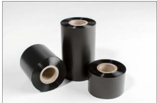
Ribbons for printing on Tubing and TipTags.