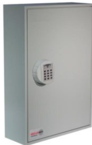
System 20 Electronic Lock REVO A