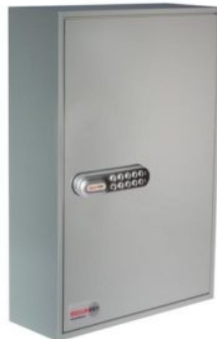
System 200 CL1000 Electronic Cam Lock