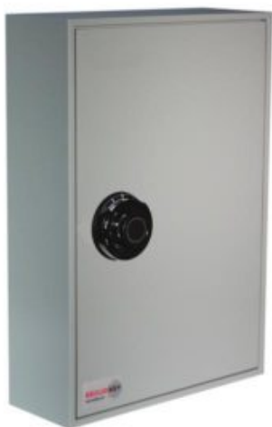
System 200 Dial Combination Lock